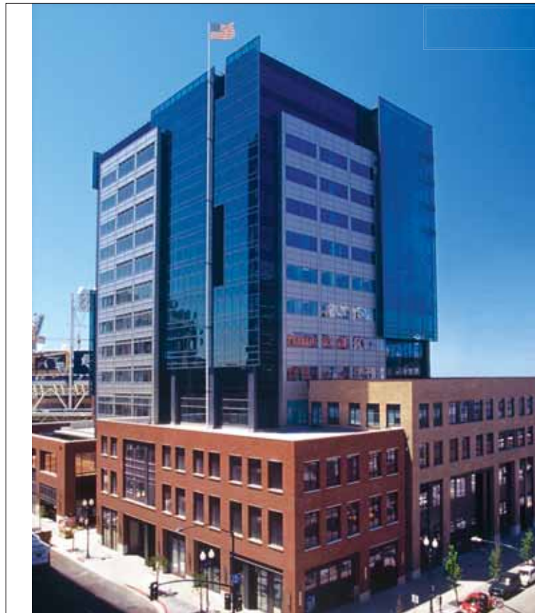
DiamondView Tower Tenant Interiors